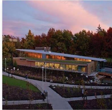
First Peoples' House, UVic